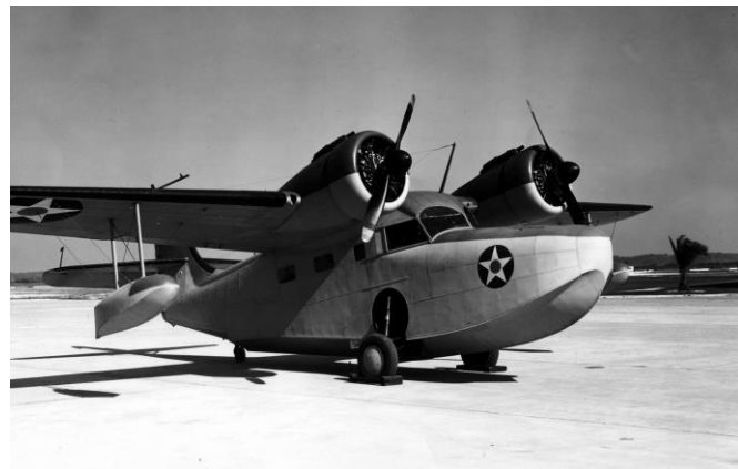
1937 - Grumman Goose with wing floats