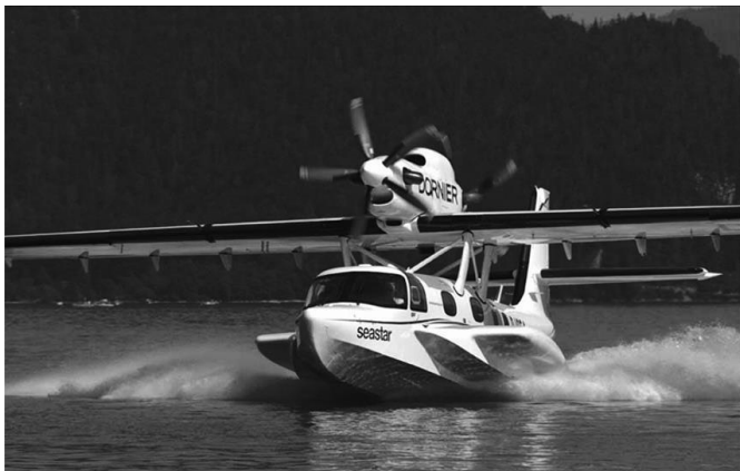
1984 - Dornier Seastar with sponsons