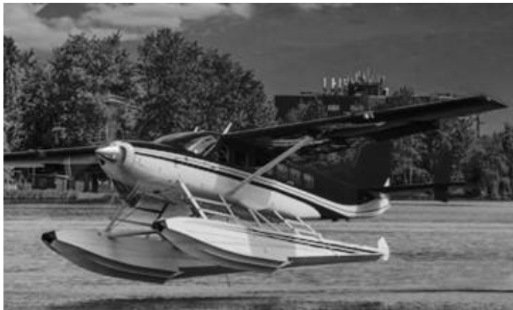
1982 - Cessna 208 Caravan on floats